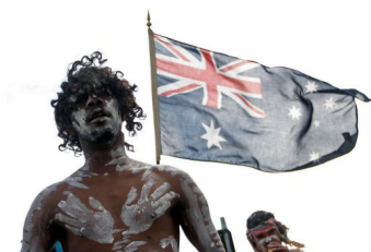
10- THE WORLD