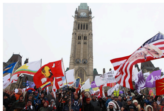
7- IDLE NO MORE